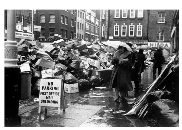
Figure 3 – Examples of Photographs used for Photo Elicitation (top to bottom, left to right): Jarrow Crusade, Shipbuilding on the Tyne, Walker Dwellings, Winter of Discontent, Miners' Strike, Meadow Well Riots)