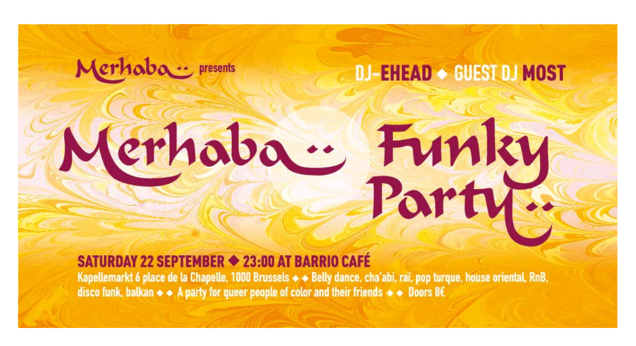
Figure 3: Flyer of Merhaba Funky Party, September 2017