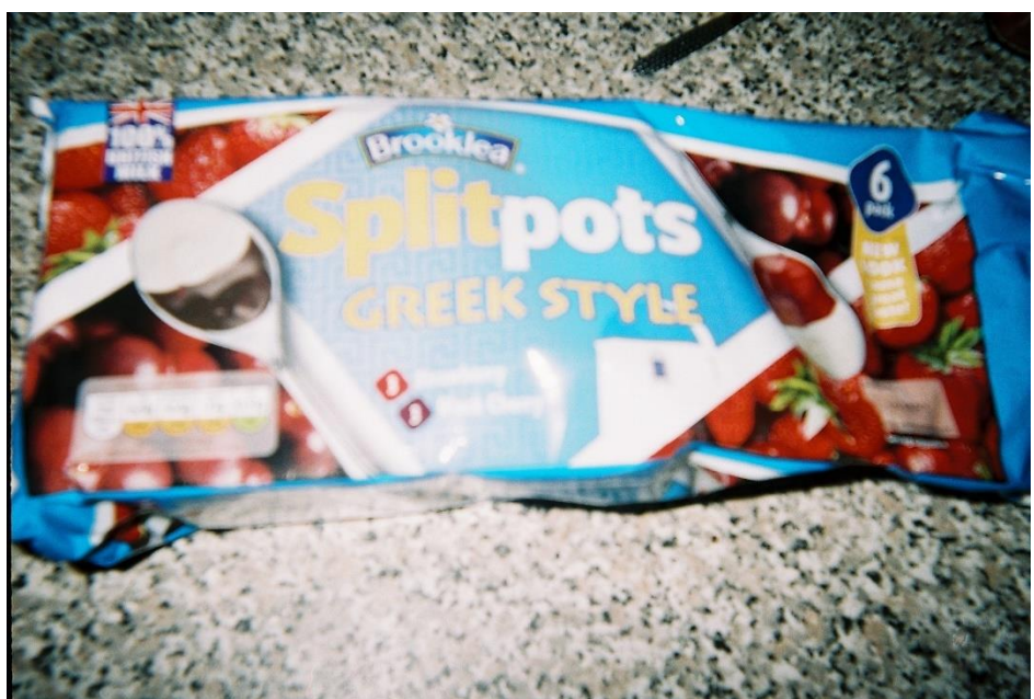
Figure 2: Peter, photo 3 and photo 5 – high-protein foods Peter felt that another "£30 or £40 a week" would make all the difference in terms of being able to afford enough food, and the right foods. As he puts it:

It's not a huge amount, it'd make a big difference even just to having porridge today or a proper meal. [T3]