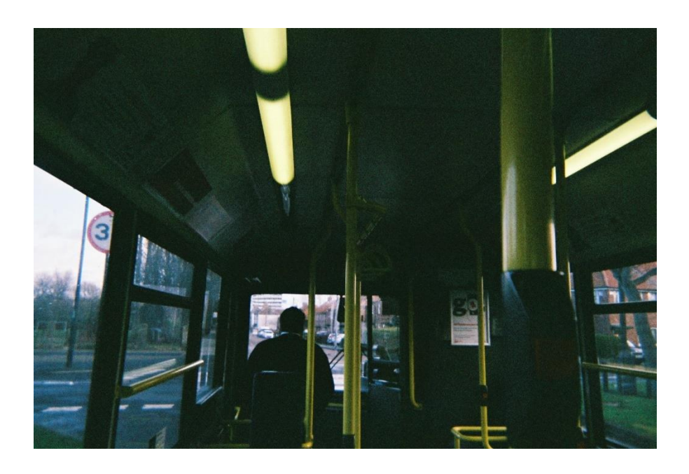
Figure 4: Shirley, photo 5 - free shopping bus

Brian also chose to photograph the free bus service, explaining that it was important to him for accessing food. His health problems meant that he was unable to carry large amounts of shopping, thus the bus aided him in doing smaller, more frequent shops: