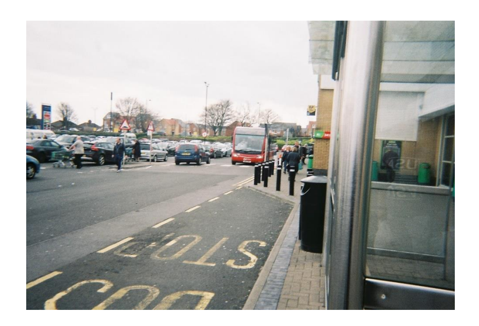
Figure 5: Brian, photo 10 - waiting for the free shopping bus

Although the free bus service helped to increase the proportion of participants' disposable income available for spending on food, food budgets were still constrained and there remained a need to devise strategies to ensure that the budget was adhered to. Within these constraints, participants did still attempt to satisfy preferences for particular foods or particular shops. However, the extent to which participants could achieve this was curtailed. Here, Linda talks about her shopping strategies and preferences: