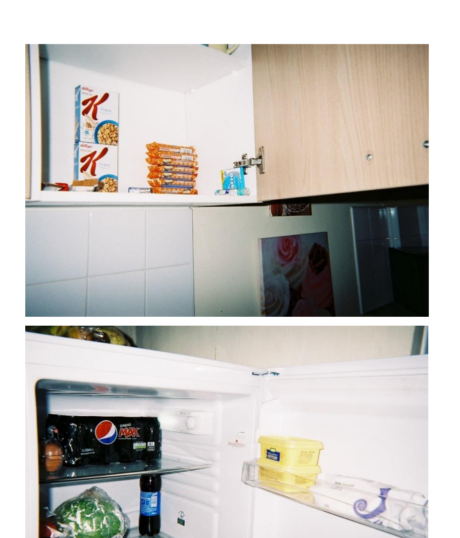
Figure 3: Mary, photos 6 and 9 - cupboard and fridge

Shirley had also chosen to photograph the contents of her fridge to show the difficulty that she had with affording to buy enough food, but unfortunately these photographs did not develop. Nevertheless, she explained what she had been keen to show: