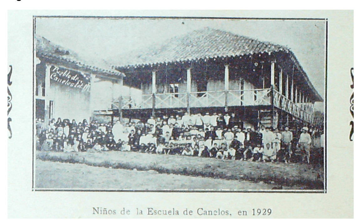
Figure 2 - Children of the 1<sup>st</sup> School of Canelos

other are portrayed as receiving education, but not necessarily forming part of a 'school' institution.