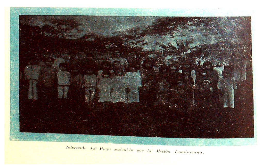
Figure 3 - Children of the 1st Orphanage in Puyo