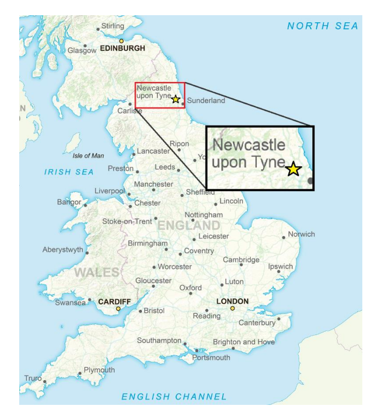
Figure 1.3: Map showing the location of Newcastle within the United Kingdom.

England. Newcastle city centre, and the surrounding localities, are connected by extensive road networks, local bus and train (The Metro) services. It is well connected to Scotland and London through rail links. The city is predominantly a 'white' city, having proportions of other ethic and racial groups. The west end of the city is usually home to migrants with small diasporic communities gathered there. There is also a small China Town – one main street – that is is on the edge of the city centre.