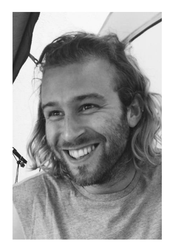
Figure 2.1: Grindr profile and picture.

I used Grindr as the method of recruitment for this research. I set up a 'research' profile (see figure 2.1) that was separate to my previous personal Grindr profile. The profile stated that I was looking for participants to part take in a research project on Grindr, masculinity and manliness. I uploaded the profile at the beginning of August 2015 after I returned to the city from a three week holiday. Being absent from Newcastle meant that I was not 'present' on Grindr. I chose to do this as a prolonged absence from Grindr could make me 'appear new' when I used the app again. I did this as a way to attempt to position myself as a 'researcher' rather than a 'user'. I used a picture of me (see figure 2.1) (instead of a picture of the Newcastle University symbol, for example) as I wanted to 'flesh' out the research project. In other words, I wanted to give participants an insight into who I was – or at least how I looked – if they were going to meet me in an offline