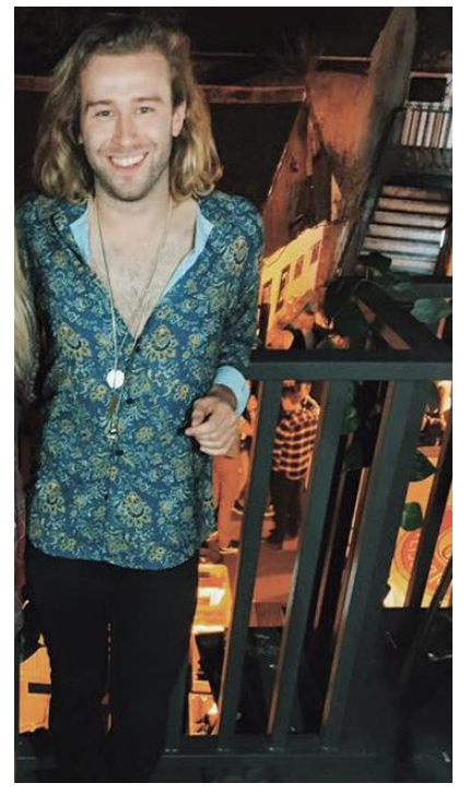
Figure 2.2: Grindr profile picture.

Two months through the research, I changed my profile picture to one of my face and body (see figure 2.2). I decided that I wanted to 'update' my picture to one that was more recent of me. I hoped that it would further 'flesh' out the research project, as it displayed a different part of my body/flesh. Additionally, I thought having a 'fresh Grindr profile' may 'attract' other Grindr users to the profile, read the information about the project and begin a conversation. In this sense, I was providing a 'fresh' recruitment advertisement.