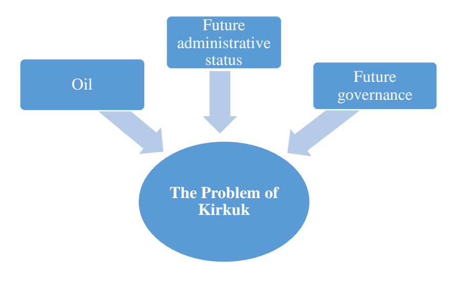
Figure 1 A figure showing three factors that constitute the problem of Kirkuk

administrative status and future governance. Although the territorial control of Kirkuk and its internal governance are at the heart of disputes over the city, the role of oil cannot be overlooked. The discovery of vast amount of oil was the main reason for annexing Kirkuk to the Iraqi kingdom in 1925 as part of Mosul Vilayet (Galleti, 2005: 22). The Kirkuk oil field alone is estimated to be 10 billion barrels (Sevim, 2014: 14). It is the second-largest oilfield in the country, containing 20 percent of Iraq's known oil reserves (Stansfield and Anderson, 2009: 137). Kirkuk is potentially one of the richest cities of the world and its wealth of resources- estimated by some to near 4 per cent of the world's known oil and gas reserves (Bilson et al, 2011). Thus, oil makes Kirkuk quite unique in comparison to other contested cities around the world. In short, the historical, political and economic dimensions of the problem of Kirkuk makes it a unique and fascinating, but at the same time a difficult and complicated case study.