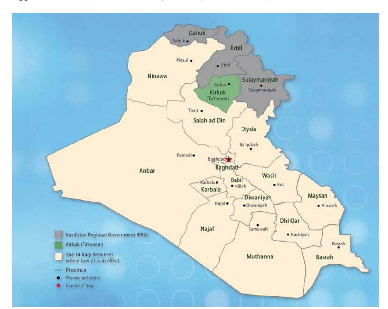
Appendix D: The governorates of Iraq, including Kirkuk and the provinces of KRG.

Adapted from: Law of governorates not incorporated into a region' by USAID. Available at: <a href="http://iraq-lg-law.org/en/webfm_send/765">http://iraq-lg-law.org/en/webfm_send/765</a>