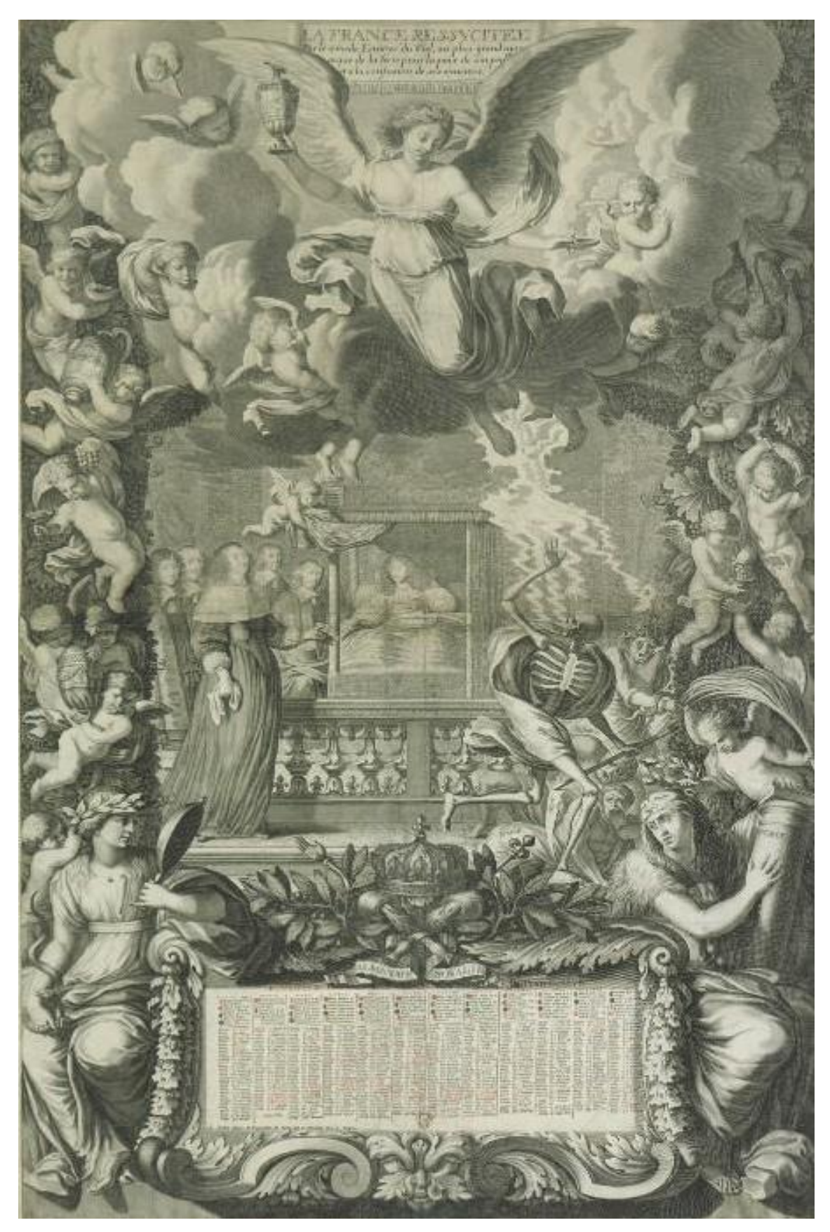
Illustration 2: La France ressucitée par le remede, envoyé du ciel, au plus grand monarque de la terre pour la paix de son peuple et a la confusion de ses ennemis. Engraving by Jean Lepautre, Nicolas de Poilly and Nicolas Regnesson, dated 1659.