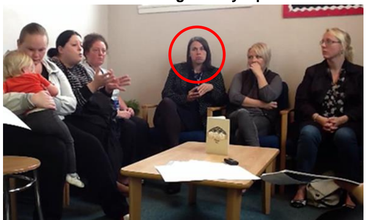
Figure 5. A moment showing Deputy Head Teacher pondering about something said by a parent

Through the video analysis and subsequent shared feedback with teachers (session 4), a new understanding appeared to be created that went beyond the 'known and familiar' to 'what it is possible to know' in terms of being a supportive school, have parent-teacher relationships, and be in partnership (White, 2007 p. 263).