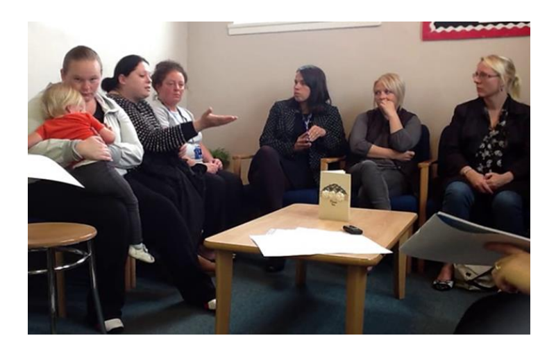
Figure 4. A moment showing parents and teachers talking about "Raising kids that are going to be the next bunch of adults"

In this moment power had shifted and change had occurred in how a parent was received and heard. For this group of parents, that moment held the possibility of change and a preferred richer description in narrative terms in which they were seen as having something important to say and where they were valued as equitable participants in school (White, 2007). Furthermore, given that interaction is the central principle in VIG, the parents were able to see their own strengths in the interactive encounter with teachers, 'it is not what a person does that is important but what that person does in response to another, and that both partners are equally affected by disruptions in communication' (Cross & Kennedy, 2011, p. 71).